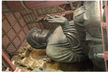
Great Buddha of Nara