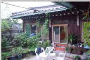
가회동 11-44, 45번지(전)