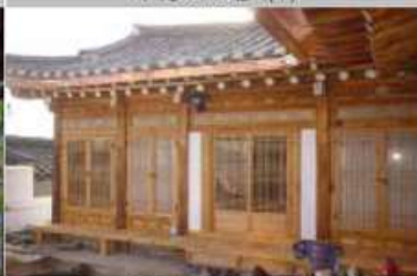
가회동 11-44, 45번지(후)