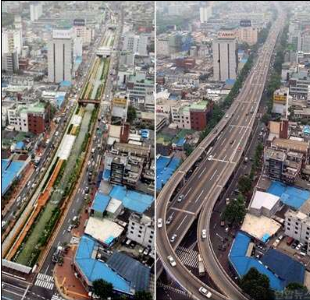
After the Project