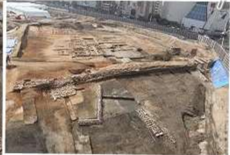
▶ 발굴 현장의 유구 전경